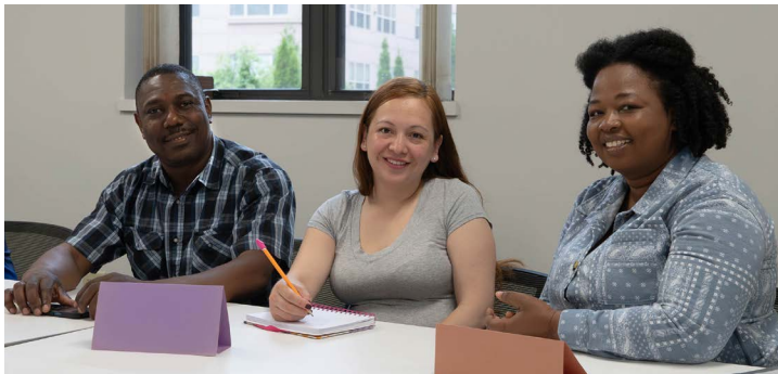
The ILC Students discover summer fun activities that promote their children's learning in a summer success family literacy workshop.

In the spring, she held a "summer success" workshop to help caregivers with children out of school for summer break discover fun activities that promote learning. These workshops are also valuable for community-building. Caregivers from different classes had a chance to meet, and many exchanged contact information and planned outings or playdates with their children.