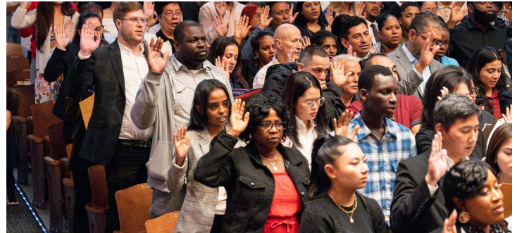
New U.S. citizens being sworn-in at The-ILC-sponsored ceremony.

At least 50 new voters were enrolled that day as well, thanks to our friends at MIRA Coalition registering them on sight following the ceremony.