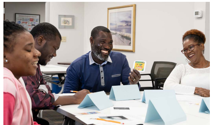
The ILC Students learn English words for school supplies as they prepare to send their children back to school in a family literacy workshop.

Family literacy is another example of how The ILC helps not only individuals, but entire families.