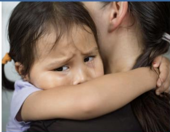
The Day That ICE Came: How Worksite Raids Are Once Again Harming Children and Families