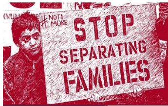
Our Children's Fear Immigration Policy's Effects on Young Children