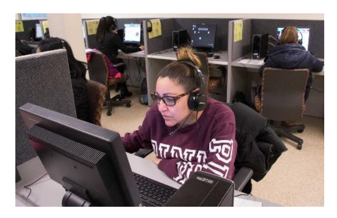
Thanks to the Adelaide Breed Bayrd Foundation, The ILC students are learning on current equipment.