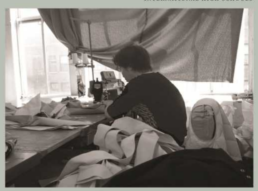
INTRODUCTION BY Marcelo M. Suarez-Orozco Edited by What Kids Can Do

BY THE STUDENTS OF THREE NEW YORK PUBLIC INTERNATIONAL HIGH SCHOOLS