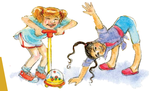
Illustration © Nicole Tadgell.

pproximately 40 percent of children in U.S. public schools are from culturally diverse backgrounds (NCES 2003). Yet, other than in Head Start—where 52 percent of teachers come from a variety of racial,