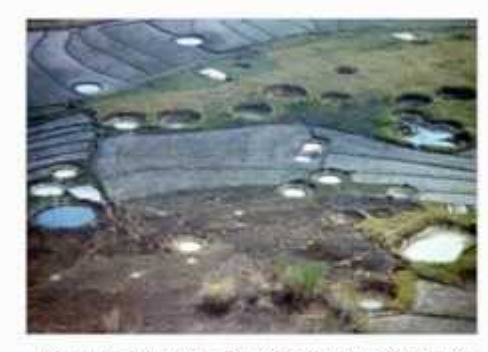
Laos, 1983. An intensive bombing campaign, coupled with artiflery battles on land, has left the landscape in some areas of Lags filled with craters.

Up to a third of the bombs dropped did not explode. leaving Laos contaminated with vast quantities of unexploded ordnance (UXO). Over 20,000 people have been killed or injured by UXO in Laos since the bombing ceased. The wounds of war are not only felt