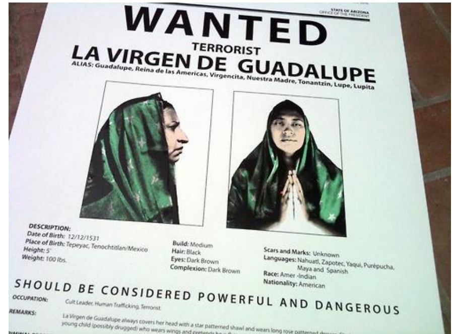
Poster by Ester Hernandez against SB 1070