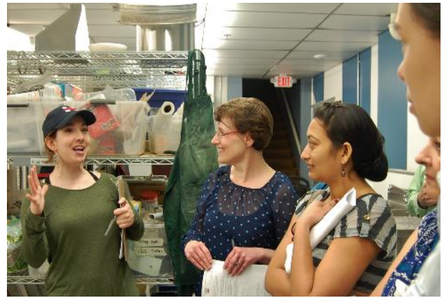
Students in the pilot Entrepreneurship Class who are interested in launching food-based businesses visit Stock Pot, a shared licensed commercial kitchen

Immigrants and refugees who come to this country with the dream of owning their own business face many barriers. In addition to learning English, they face cultural barriers and a whole regulatory environment that is completely foreign. This spring, The ILC began a pilot class for students who want to learn about starting or growing a business and need to improve their English.