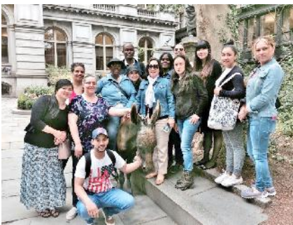
ILC Theater students learn about American history on the Freedom Trail