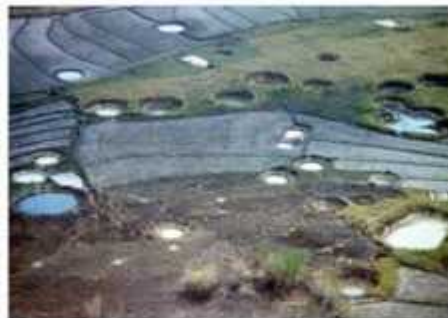
Laos, 1983. An intensive bombing campaign, coupled with artillery battles on land, has left the landscape in some areas of Laos filled with craters.

From 1964 to 1973, the U.S. dropped more than two million tons of ordnance on Laos during 580,000 bombing missions—equal to a plane load of bombs every 8 minutes, 24-hours a day, for 9 years—making Laos the most heavily bombed country per capita in history. The bombings were part of the U.S. Secret War in Laos to support the Royal Lao Government against the Pathet Lao and to interdict traffic along the Ho Chi Minh Trail. The bombings destroyed many villages and displaced hundreds of thousands of Lao civilians during the nine-year period.